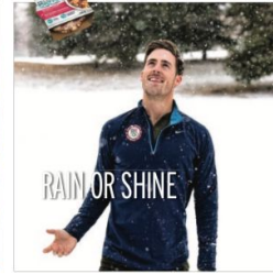
ATHLETE (tossing a Bistro Bowl): RAIN OR SHINE RAIN OR SHINE