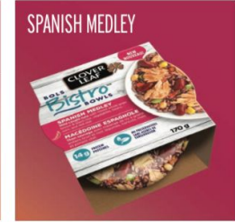
SPANISH MEDLEY SPANISH MEDLEY