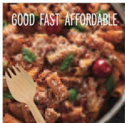
ALL WITH WILD CAUGHT TUNA, VEGGIES, PASTA OR RICE GOOD FAST AFFORDABLE