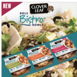
NEW CLOVER LEAF BISTRO BOWLS. NEW CLOVER LEAF BISTRO BOWLS.