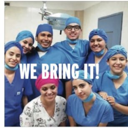
SURGICAL TEAM: WE BRING IT! WE BRING IT!