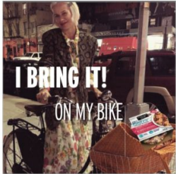
STYLIST (BB in basket): I BRING IT! ON MY BIKE! SUPERS: I BRING IT! ON MY BIKE