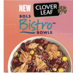
AVO: 3 NEW CLOVER LEAF BISTRO BOWLS NEW CLOVER LEAF BISTRO BOWLS