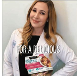
DERMATOLOGIST (holding bowl): FOR A DELICIOUS... FOR A DELICIOUS