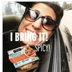
WOMAN IN CAR: I BRING IT! SPICY! I BRING IT! SPICY!