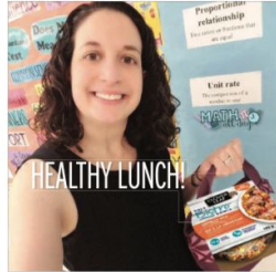
TEACHER (BB in bag): HEALTHY LUNCH! HEALTHY LUNCH