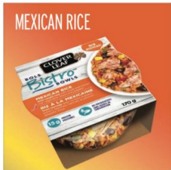
AVO: MEXICAN RICE SUPERS: MEXICAN RICE