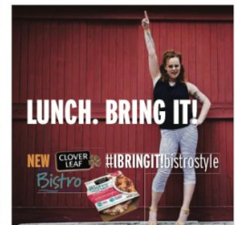
WOMAN: LUNCH. BRING IT! LUNCH. BRING IT! #IBRINGIT!bistrostyle