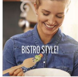
WOMAN (at work eating from bowl): BISTRO STYLE! BISTRO STYLE