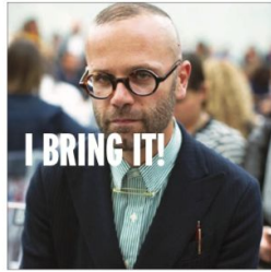
MAN (at a meeting): I BRING IT! I BRING IT!