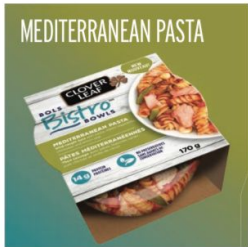
MEDITERRANEAN PASTA ... MEDITERRANEAN PASTA