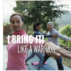
YOGA INSTRUCTOR: I BRING IT! LIKE A WARRIOR I BRING IT! LIKE A WARRIOR