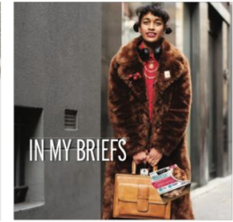
LAWYER (Bistro bowl in briefcase): IN MY BRIEFS IN MY BRIEFS